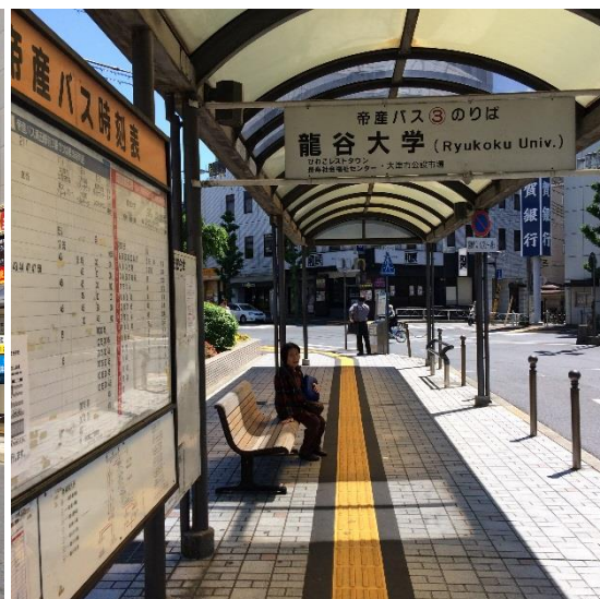
Bus Stop (3) For Ryukoku Univ.