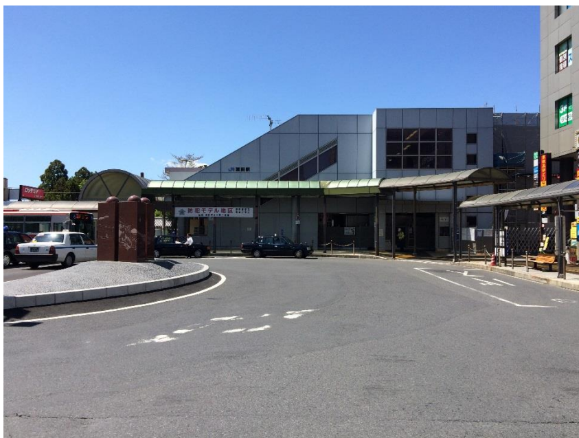
Seta Station South Entrance