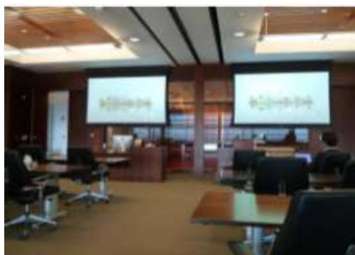
The venue before opening (Building 3, Room 5220)

◆Workshop scenery◆ ※ Only Japanese participants were taken photos by consideration of religion and culture.